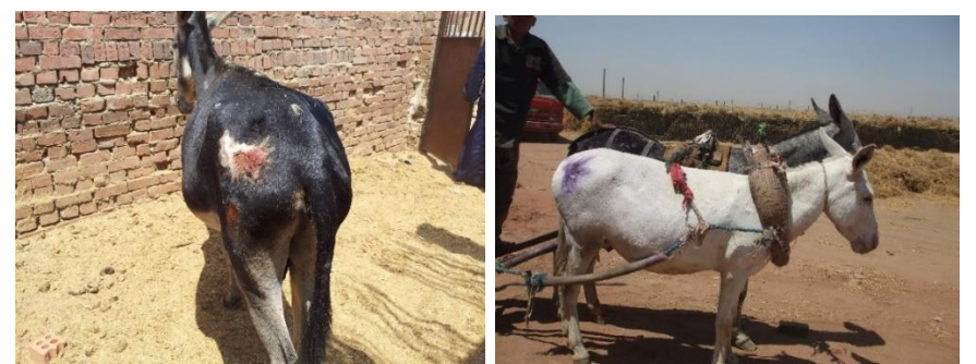
Figure 2: shows the suffering of working donkeys in brick kilns.

In " SPWDME " works 3 veterinarians, 5 veterinarian assistant, 2 specialists in educational project, 4 drivers and other administration officers.